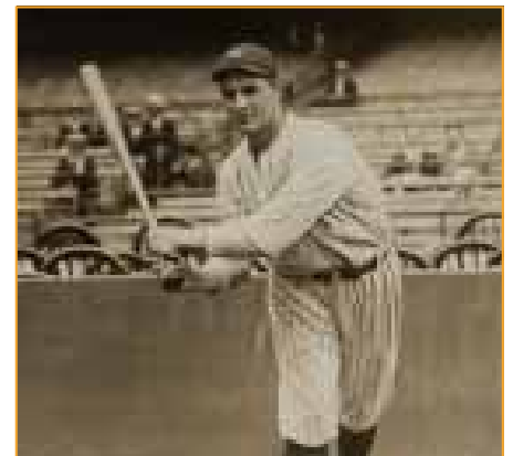
Well-known American baseballer, Lou Gehrig, diagnosed with the amyotrophic lateral sclerosis (ALS) form of MND in 1939.

"Physical activity has always been at the forefront of factors associated with MND, but studies investigating its effect have often been conflicting. The reason why we might see contrasting results is often due to different cohorts and numbers of people included in the study, the method by which the data was collected, or the types of questions asked and the way they were presented. Increased number of studies on the same topic might then improve the way these are conducted in the future and provide more reliable conclusions.